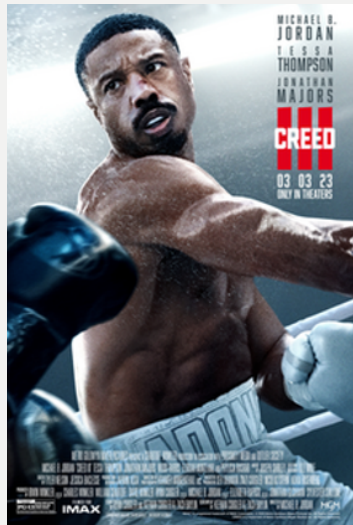
CREED III Available to rent or buy on Amazon Prime Video.

Adonis (Michael B. Jordan) has been thriving in both his career and family life, but when a childhood friend and former boxing prodigy resurfaces, the face-off is more than just a fight. Adonis must put his future on the line to battle Damian (Jonathan Majors) --a fighter who has nothing to lose.