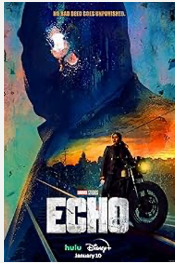
ECHO Streaming on Disney+