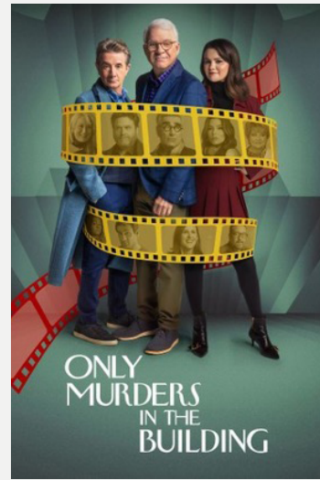
ONLY MURDERS IN THE BUILDING Streaming on Disney+

Alaqua Cox, who is herself Native American, deaf, and wears a prosthetic leg is a trifecta of representation and there is a fair amount of ASL used throughout the series. Viewers be warned though, with a rating of TV-MA, Echo is not a show for the faint of heart.